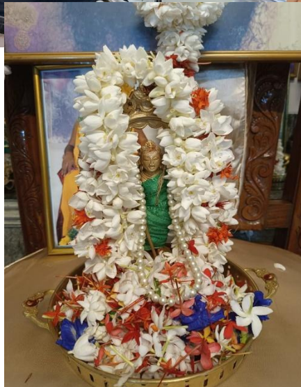
Clockwise from top left: Abhishekam to Lord Muruga statue, Devotees chanting mantra, Beautifully decorated Lord Muruga statue after the abhishekam, Blessings with Muruga statue